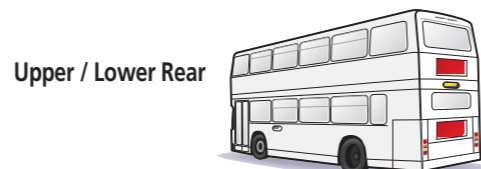
Upper / Lower Rear