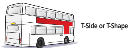
T-Side or T-Shape