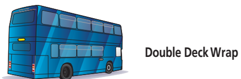
Double Deck Wrap