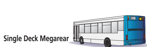
Single Deck Megarear