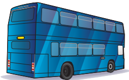
Double Deck Wrap