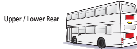
Upper / Lower Rear