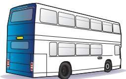
Double Deck Mega Rear