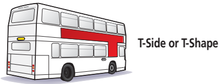
T-Side or T-Shape